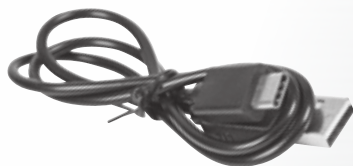
USB-A to USB-C Charging Cable